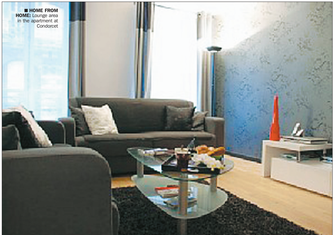
■ HOME FROM HOME: Lounge area in the apartment at Condorcet