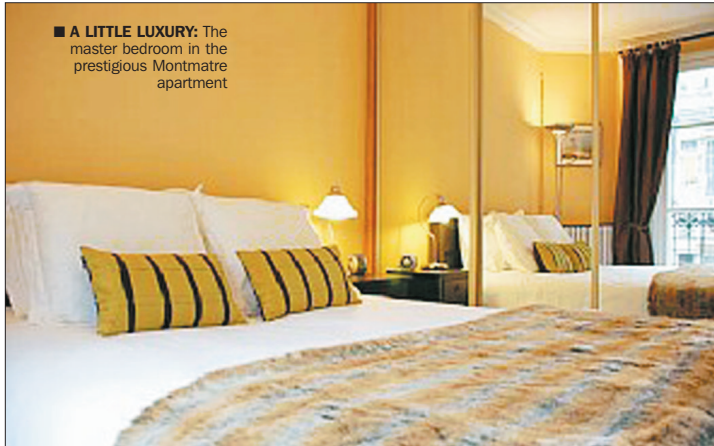
■ A LITTLE LUXURY: The master bedroom in the prestigious Montmartre apartment